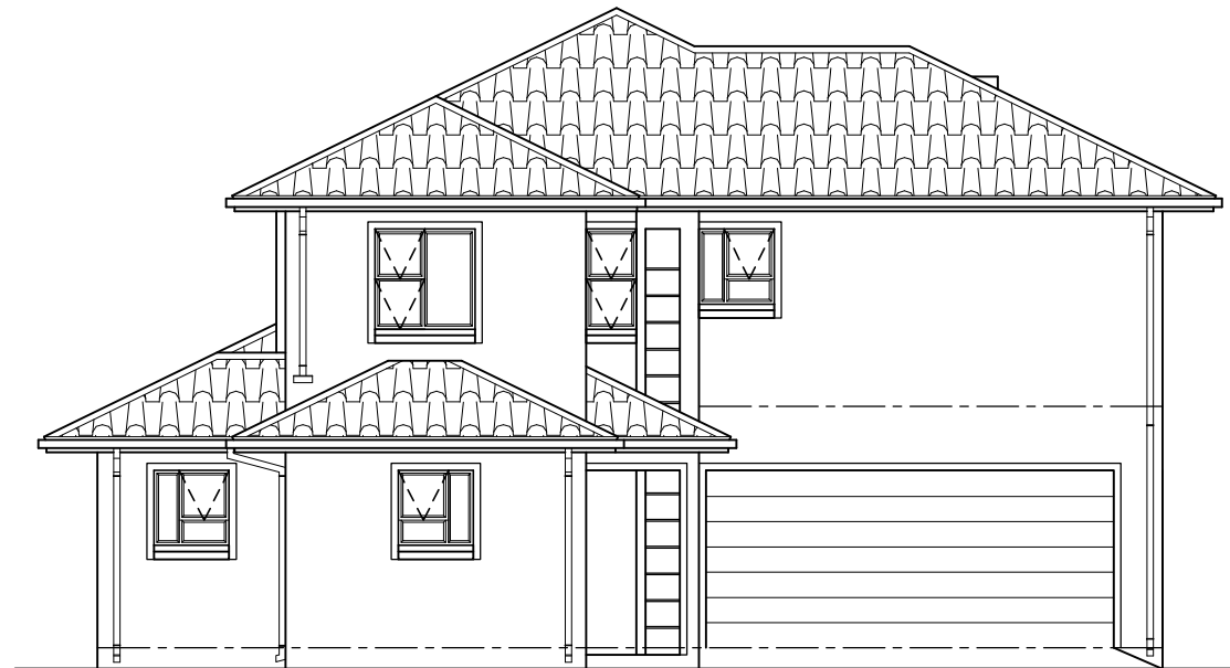
SOUTH ELEVATION (1:100)