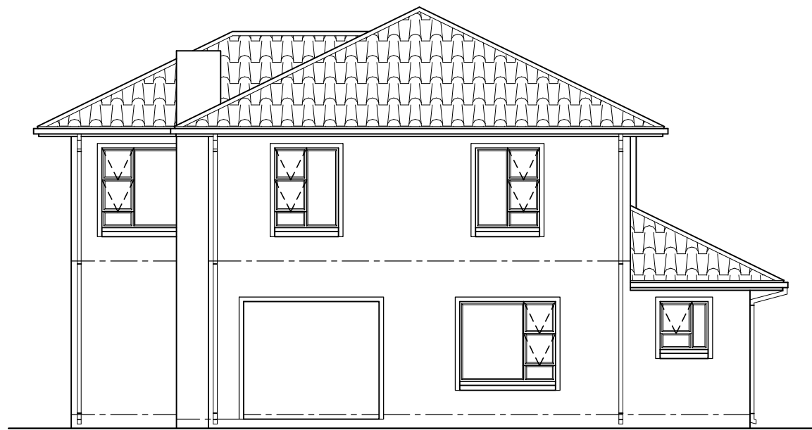
NORTH ELEVATION (1:100)