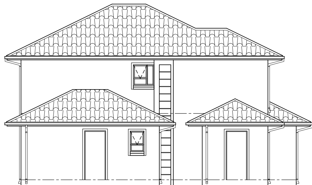
WEST ELEVATION (1:100)