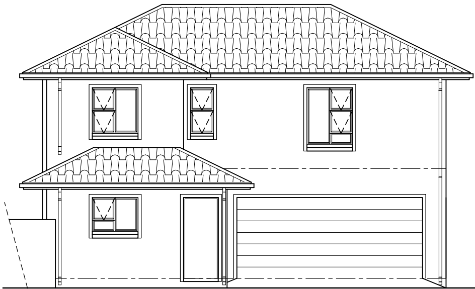
SOUTH ELEVATION (1:100)