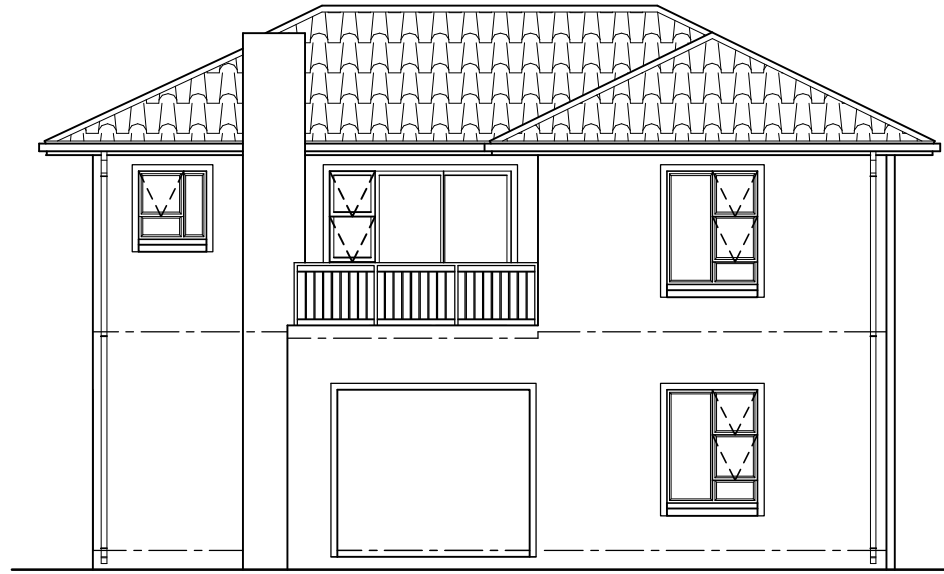
NORTH ELEVATION (1:100)