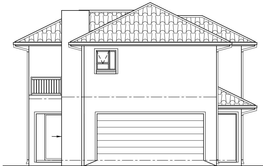
WEST ELEVATION (1:100)