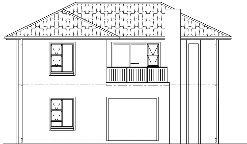
NORTH ELEVATION (1:100)