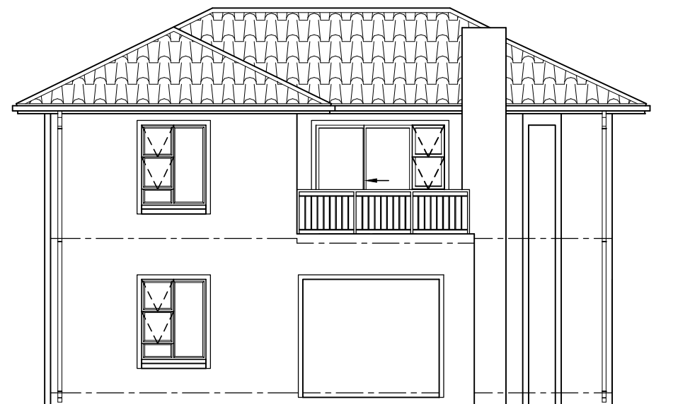
NORTH ELEVATION (1:100)